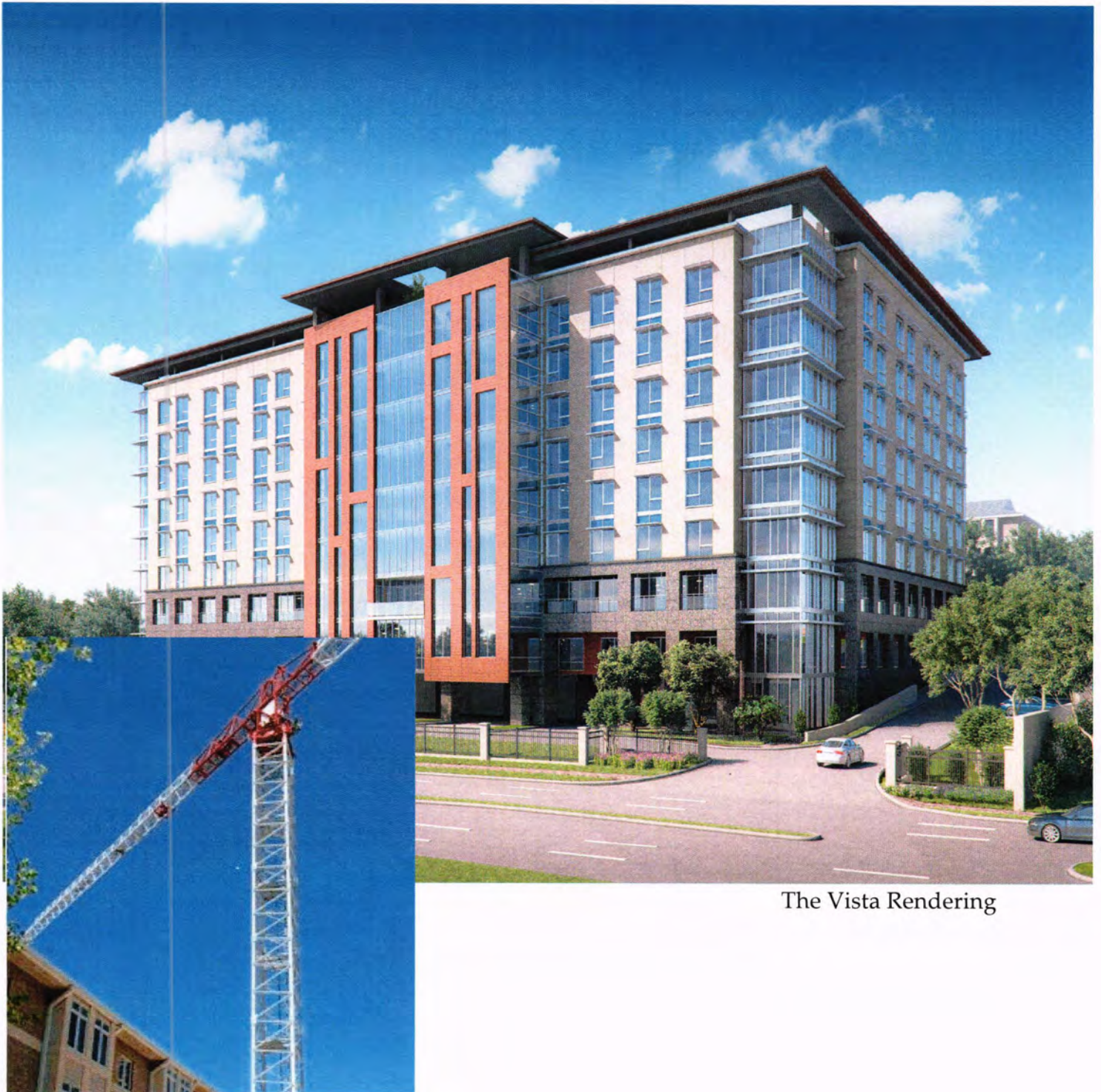
The Vista Rendering