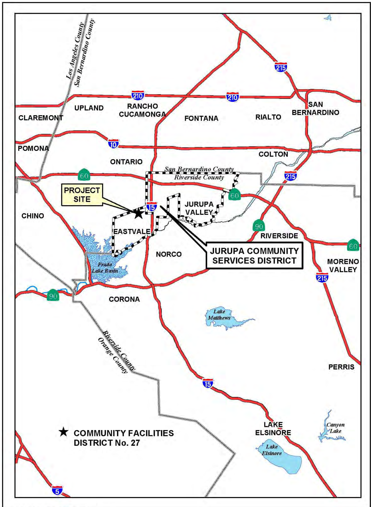
Figure 1. Regional Location Map